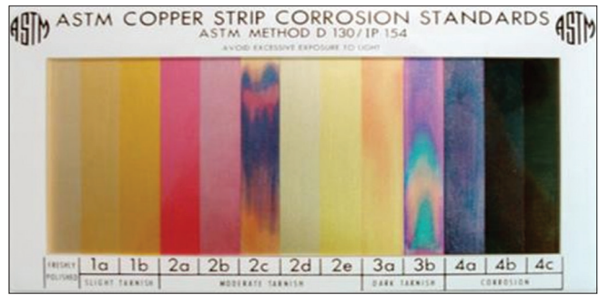
Figure 3: Standard color code