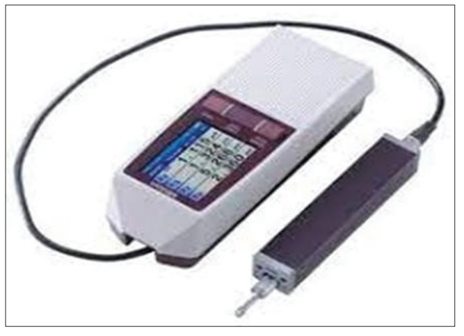
Figure 5: Surface roughness measuring instrument

rotating disc. The pin can be any shape, although the most common shapes are spherical (ball or lens) or cylindrical due to the simplicity with which they can be aligned (flat pins are frequently vulnerable to misalignment, which can result in uneven loads and make theoretical analysis challenging). The COF is measured using the software attached to the system.