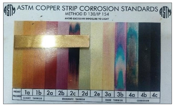
Figure 6: Corrosion stability

Surface roughness is measured by using Mitu toyo equipment which is shown in Figure 5. The first step is to remove dust and oil from the measuring target surface and adjust the surface in accordance with the probe extension of the equipment.