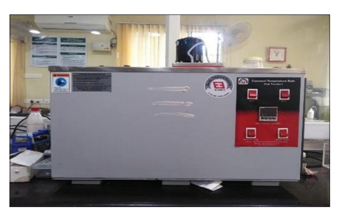
Figure 2: Copper strip apparatus