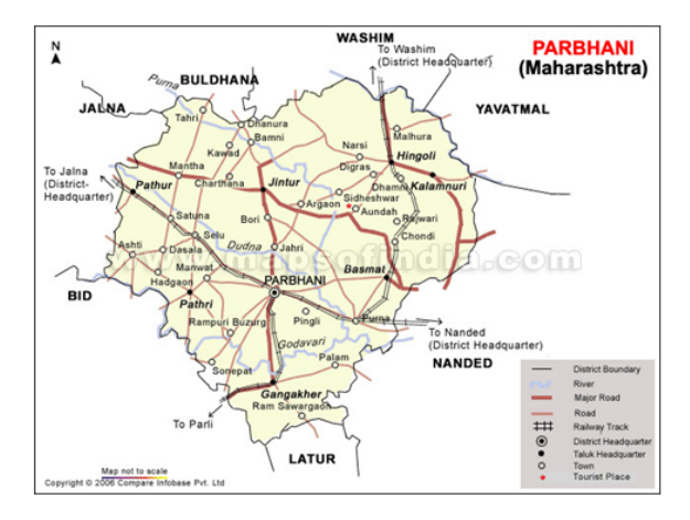
Parbhani District Map

The leachability of the pesticides in groundwater is controlled by the nature of the soil and the pesticides themselves [4]. The pattern of pesticide use, their degradation products, soil texture and the total organic matter in the soil are important factors for this process. Fine texture soils, in general, inhibit pesticide leaching because of either low vertical permeability or high surface area which enhances adsorption of pesticides. The high organic matter content in the soil dissolves the pesticides and checks their transportation into the soil. pH and the temperature of the soil are also important factors for the leachability of pesticides [5,6,7,8]. However, the mass flow of water through the soil profile is also an important factor for the leaching of pesticides in groundwater.