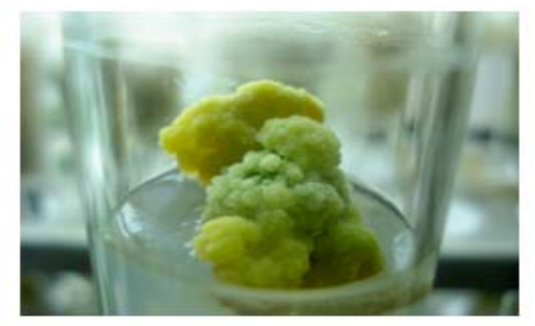
Plate.1 Callus from Stem explant

Within seven to 15 days of culture, callus formed at the cut surfaces of nodal explants, when grown on MS supplemented with 2, 5 and 8 mg/1 BAP and Kin either alone or in combination with 0.1 - 1.0 mg/1 NAA, IAA and IBA (Table 1). Maximum (80%) callus formation took place on MS fortified with 5.0 mg/1 BAP with 0.5 mg/1 NAA after two successive subcultures. In this combination light yellowish green and nodular callus developed. Callus was also induced in BAP and Kin supplemented medium. However, BAP was found to be more effective than Kin for callus induction (Table 1).