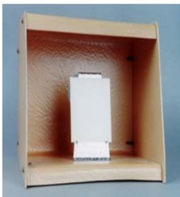
Sulfuric acid spray cabinet

The spectrophotometer can measure the amount of light (of certain frequency) transmitted or adsorbed by the solution. This light that has not been absorbed by the solution in the cuvette, will strike the phototube. The photons of light that strike the phototube will be converted into electrical energy. This current that is produced is very small and must be amplified before it can be efficiently detected. The signal is proportional to the amount of light which originally struck the phototube and is thus an accurate measurement of the amount of light which has passed through (been transmitted by) the sample. Different compounds having dissimilar atomic and molecular interactions have characteristic absorption phenomena and absorption spectra. Concentration of every component may be found from the spectrophotometer measurements and calibration curve made using the samples of known concentration. In this study the spectrophotometer used was Ultrospec III (Pharmacia). All samples were analysed at an absorbance of 410 nm and optical density was recorded.