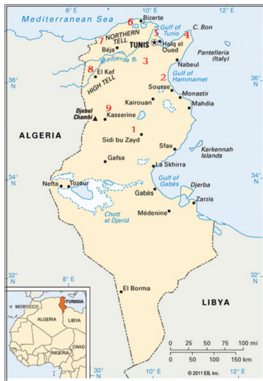
Figure 1: Tunisian populations of Brachypodium hybridum and their bioclimatic regions: (1) Fayedh (arid); (2) Enfidha (lower mi-arid); (3) Jbel Zaghouan (upper mi-arid); (4) Haouaria (sub-humid); (5) Raouad (upper mi-arid); (6) Jnen (humid); (7) Ain Drahem (humid); (8) El Kef (lower mi-arid); (9) Douar El Hej Wniss (mi-arid)

primer pairs for amplification efficiency with 2 high-quality DNA samples from each population. Amplification was optimized by varying the concentration of the