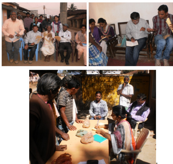
Fig 2. Different Landraces collected from the different region of Raigarh district.

A total of 97 rice land races were collected from these regions (Fig 2). All these land races possess different morphological and quality traits.