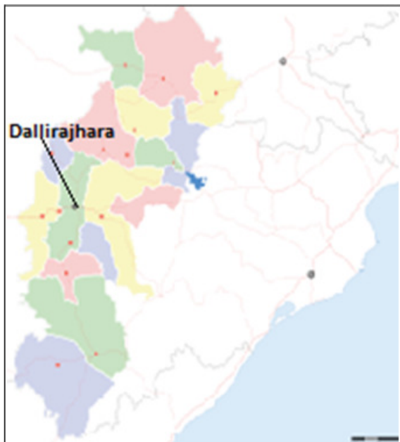
Fig 1.3 shows the location of Dallirajhara mine in C.G.