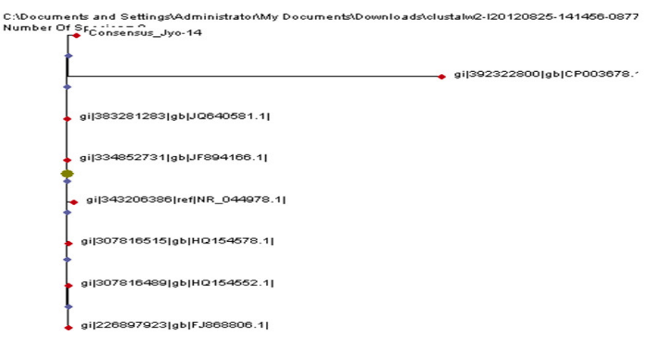
BLAST tree result for Enterobacter cloacae strain AB6