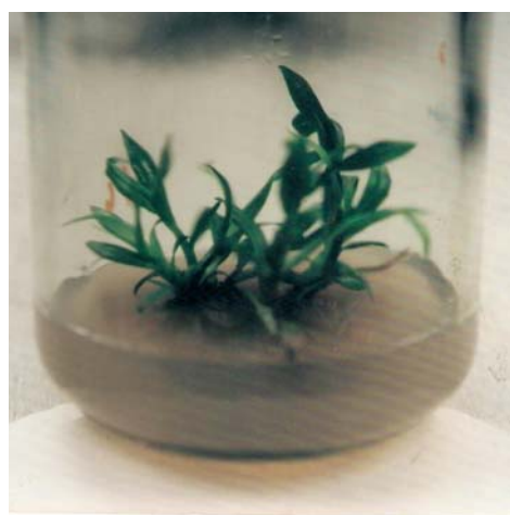
Fig. 1B. Seedlings with well developed roots after 16 weeks and ready for hardening.