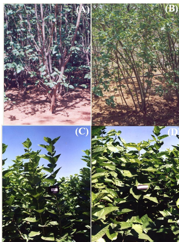
Fig 2: Comparison of field performance of one-year old plants of S-36 cultivar established from nodal cuttings with micropropagated plants. (A) Stem cutting raised plants, (B) Micropropagated plants. (C & D) Establishment of both stem cutting raised plants and micropropagated plants after three years.

CP*- Stem cutting derived plant MP*- Micropropagated plants Means followed by the same letter in a column are not significantly different (p < 0.05) by Newman-Keul's multiple range test.