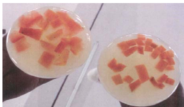
Fig. 1. Co-cultivation of Salmonella enterica and carrot

Cut pieces of carrot and cucumber were co-cultivated with S. enterica and A. hydrophila culture under aseptic conditions for in vitro infection. The co-cultivation of carrot tissues with bacterial suspension in conical flasks is presented in Fig. 1. A control nutrient broth flask with pieces of each vegetable was maintained separately to check for any contaminating bacteria from fresh vegetables. Absence of turbidity in control flasks indicated that the growth of the bacteria in test flasks is due to inoculated bacteria.