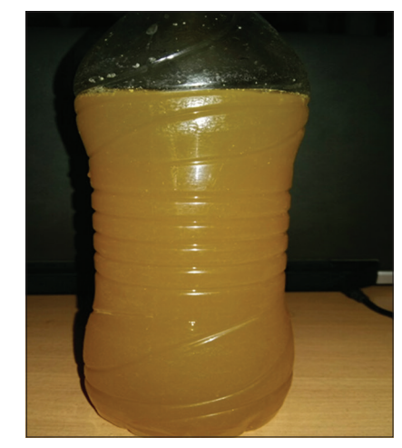
Figure 4: Neem leaf extract

local market to hold 1 kg paddy. The moisture content of paddy was measured by digital moisture meter. 1 ball was kept in each of 3 samples (sample noted as T11, T21, and T31 respectively). 2 balls were kept in each of 3 samples (sample noted as T12, T22, and T32 respectively). 3 balls were kept in each of three samples. These 12 samples were placed in warehouse at seed research farm as shown in Figure 6.