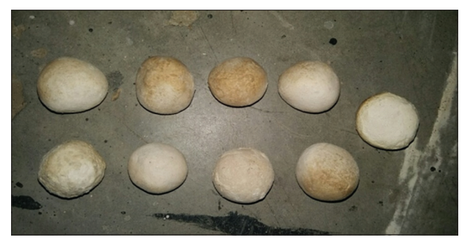
Figure 5: Balls of Indigenous mixture