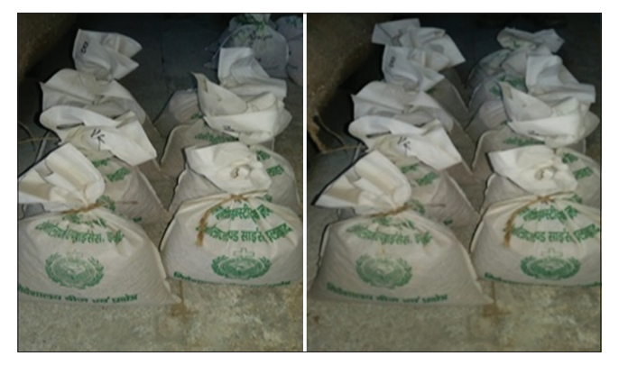
Figure 6: Paddy samples with balls

results were obtained for wheat in study of bacterial growth in wheat [7]. During storage, moisture loss takes place because CaOH absorbs the moisture content in paddy.