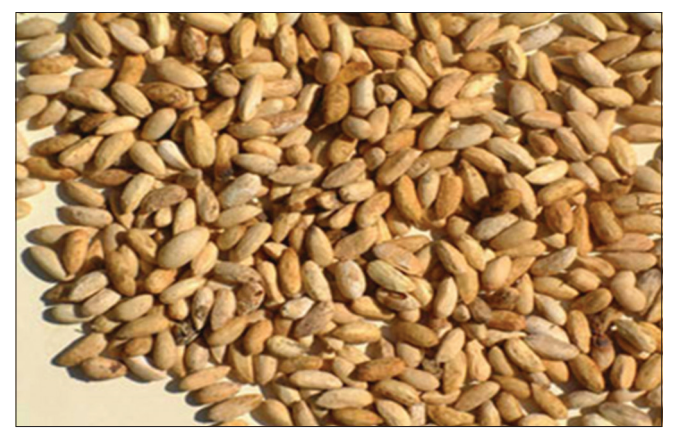
Figure 2: Neem seed kernel

filtration process. Neem extract was stored in transparent bottle as shown in Figure 3