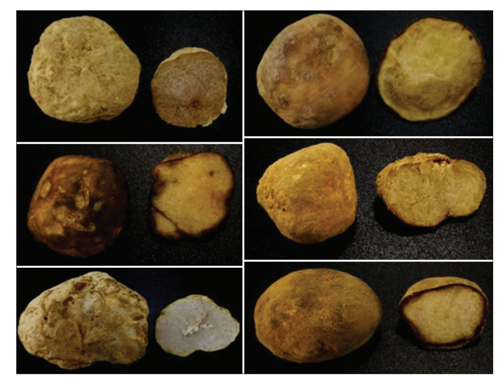
Figure 2: Truffles samples collected in this study show the morphological diversity in shape, core texture, and color