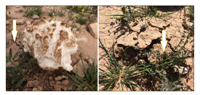
Figure 3: Right picture represent swelling of the ground for T. claveryi , ascocarp. Left picture represent T. pinoyi ascocarp over soil surface. White arrow shows Helianthemum spp plants

be a big factor for disappearance for some species and change the microflora, or the molecular identification is more accurate compare to the morphological identification that depend on the morphology characteristics.