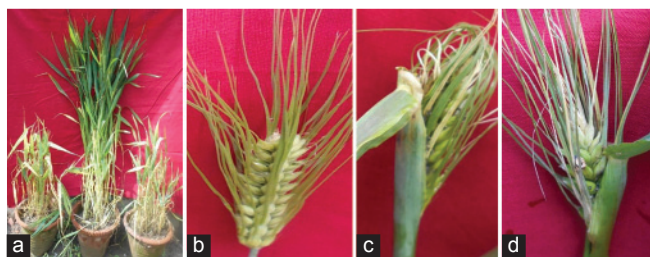
Figure 2: (a) Control plant (BH-393), Bushy/Tall, Control plant (RD-2035), (b) Spike of control plant, (c) Curved spike of variant, (d) Short spike of variant

thus increasing its activity. Some authors have reported the reduction in seed germination due to the destruction of gibberellic acid due to the mutagen thus halting the germination in GA-induced germinating seeds (Sideris et al. , 1971). Some authors have also documented the DNA synthesis inhibition as the main reason of reduction in seed germination (Hevesy, 1945).