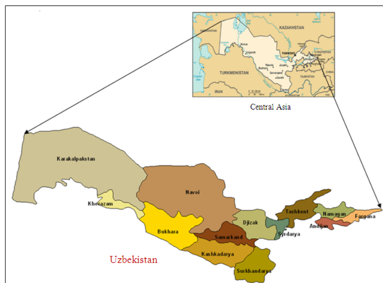
Fig. 1.1: Location Map of Uzbekistan

Bukhara, Samarqand, Namangan and the capital Tashkent. Since the 1970s, Uzbekistan's population has more than doubled. The most recent estimates put the total population at 27 million [6]. The population density is 65.5 people per square km. The desert vegetation dominates on plains and steppe, and grass meadow and forest vegetation in the mountains. Major soil types of Uzbekistan are sierozems and gray-brown desert-ones.