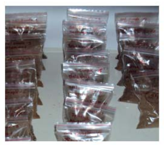
Collected soil samples

moisture loss. These samples were properly tagged, sealed and stored in refrigerator for isolation of Azospirillum .