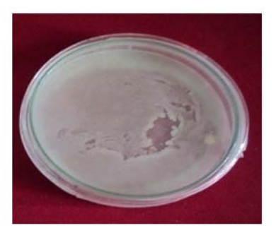
Bacterial culture on Nutrient agar media

Gram stained bacterial cell at 100x oil immersion