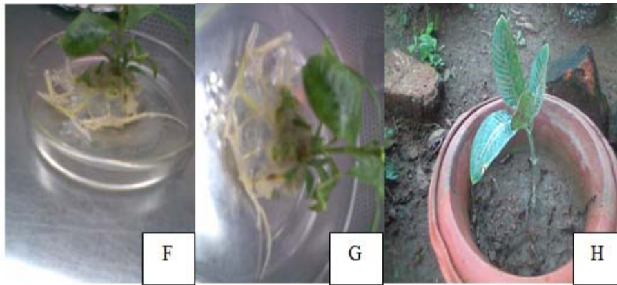
Fig (F-g): Root formation in half-strength (MSABN) Media. (H): Hardening of Gardenia gummiifera in potting mixture

The ultimate success of in vitro propagation lies in successful establishment of plants in the soil. The high survival rate in the present study (80-85 %) indicates that this procedure could be easily adapted for large scale propagation. This study will be fruitful to meet the escalating demand of this plant and will be helpful to conservation of this threatened medicinal plant. Each value represents the means \pm SE of 5 replications by using Fischer's T-test and the values are not significantly different at p \leq 0.01 .