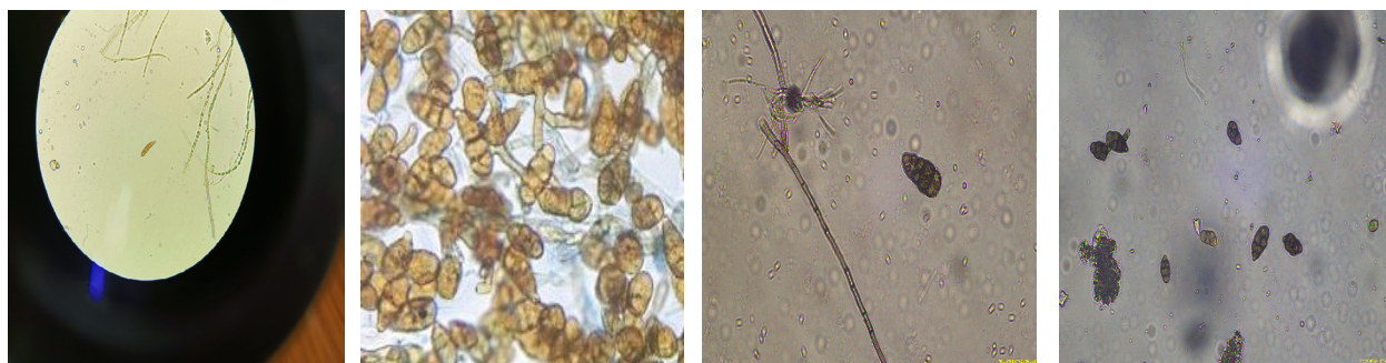
Fig. 2.2. Spores of Alternaria burnsii under light microscope

(Kusaba et al. , 2022). Since the ITS region lacks adequate resolution for species discrimination, molecular markers such as GAPDH , RPB2 , and TEF-1 \alpha are now widely adopted for accurate species identification and phylogenetic inference. Studies on A. burnsii and A. alternata isolates from cumin and related Apiaceous hosts reveal extensive genetic variability, reflecting adaptive evolution and ecological specialization under diverse climatic regimes (Mahapatra et al. , 2023).