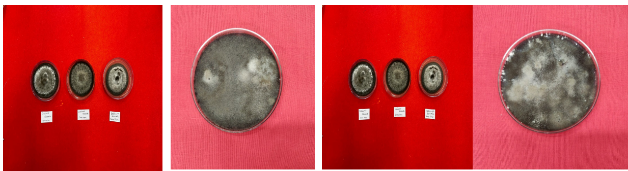
Fig. 2.1. Pure isolates of Alternaria burnsii