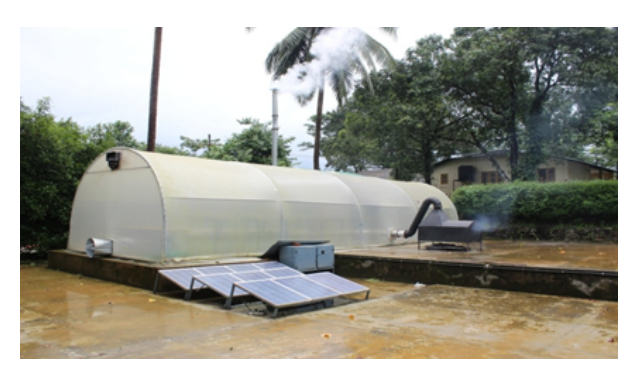
Fig. 1. Solar tunnel dryer with biomass backup