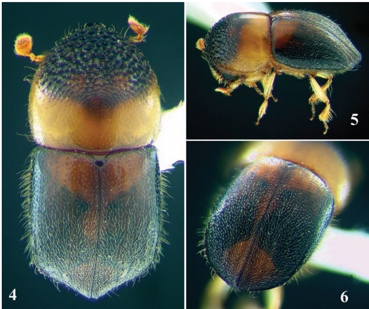
Figs 4 – 6. Diuncus corpulentus – female. (4) dorsal view, (5) lateral view, (6) elytral declivity

that trees in the southern slope of the plantation, those receive more sunshine, suffered less compared to those on the northern slope.