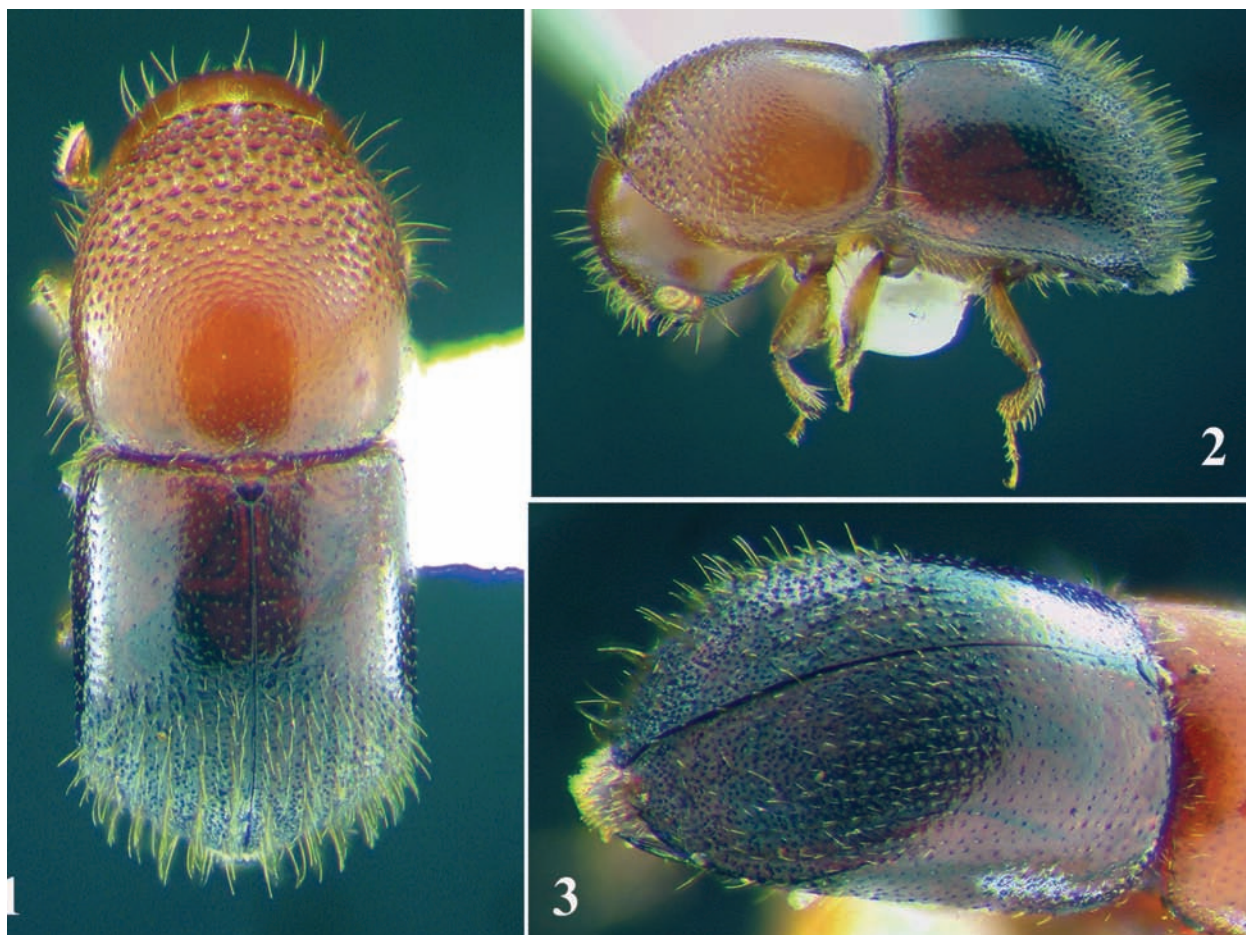
Figs. 1 – 3. Xylosandrus crassiusculus – female. (1) dorsal view, (2) lateral view, (3) elytral declivity

observed on the main stem and branches of the trees. Adults bore into the stem and construct galleries. All life stages could be observed within the galleries (Figs. 11 to 13). Xylosandrus crassiusculus construct radial, irregular galleries within the sap wood (Figs. 11 & 12) and extrude wood powder and frass in the form of a single thread (Fig. 9), while the galleries of D. corpulentus are more or less vertical and irregular (Fig. 13) and extrude shapeless mass of wood powder through the bore holes (Fig. 10). Shedding of leaves, drying up of branches and death of trees (Fig. 7) were observed.