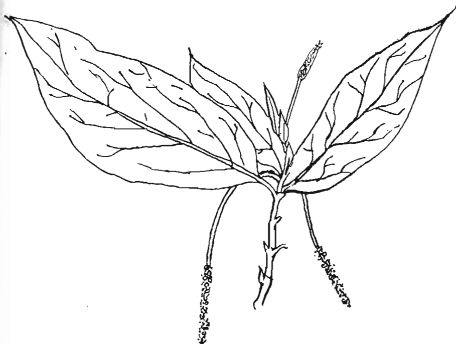
Fig. 1. A twig of P. barberi