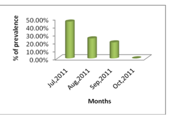
Table and Graph 6. Showing prevalence of coccidia in broiler chicken in Osmanabad District during Nov 2011 - Feb 2011(Winter Season)