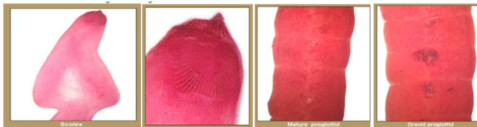
Fig 1. Microphotograph of Sengagovindii Sp. Nov.

The cirrus pouch oval, broader at anterior and narrow at posterior side and measures 0.22 (0.19-0.26) in length and 0.28 (0.22-0.34) in breadth. The cirrus is thin tube and measures 0.19 in length and 0.03 in breadth. Ovary is bilobed, large, situated middle of the segment and measures 0.57(0.45-0.68) in length and 0.61 (0.57-0.64) in breadth. The vagina is thin tube, starts from genital pore, posterior to cirrus pouch and measures 1.75 in length and 0.03 in breadth. Genital pore small, rounded and measures 0.09 in length and 0.07 in breadth. Gravid segment broader than long and measures about 1.94 in length and 5.49 in breadth. Uterus large, saccular, filled with numerous eggs and measures 0.98 (1.10-0.87) and 1.33 (1.86-0.80) in breadth. Eggs are oval, non operculated and measures 2.25 (1.61-2.90) in length and 7.58 (6.45-8.70) in breadth. The vitellaria are granular, arranged in two-three rows at each lateral margin of the segment.