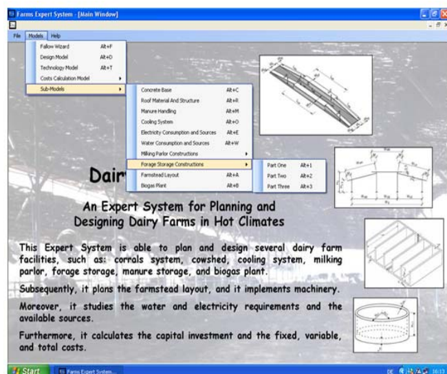
Fig. 3: Main window of the software program