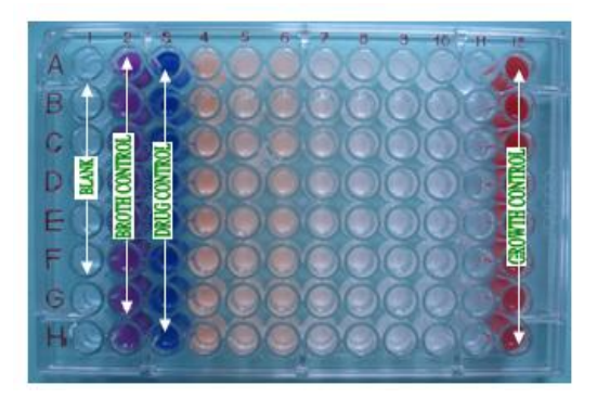
Figure 1. Format of drug testing by broth micro dilution method

having 180µl Mueller Hinton Broth (Fig. 1). So the maximum concentration of the test essential oil was 2.5mg/ml. From here the solution was serially diluted upto 4<sup>th</sup> well to 11<sup>th</sup> well resulting into the half of the concentration of test essential oil. The bacterial inoculum was prepared at 0.5 McFarland standards; the absorbance was equal to the inoculum suspension containing 1 \times 10^7 cells per ml for bacterial isolates. Then standard bacterial inoculums was added and kept for incubation at 37°C in a moist chamber. The Minimum Inhibitory Concentration (MIC) and Inhibitory Concentration at 50% (IC<sub>50</sub>) was recorded spectrophotometrically at 492 nm using SpectraMaxplus <sup>384</sup> after 24 hrs incubation.