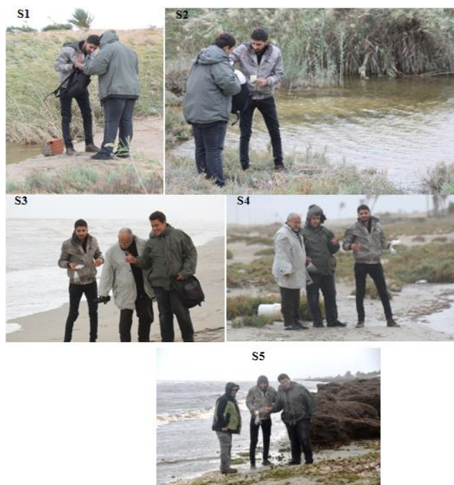
Fig. 2: Location of sampling sites: Oued El Malah (S1, S2 and S4), beach (S3) and Chott Taref El Maa (S5)