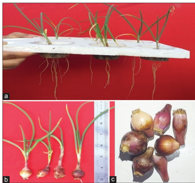
Figure 2: Hydroponically produced onions using ground water of Barishal. a. Onions in trays, b. Morphology of leaves and bulbs, c. Harvested bulbs

of land based yields in GWB and the other growth parameters also gave lower results in the hydroponics (Table 2). The earlier reports did not mention any diseases, spots or growth related abnormalities, as it was found same in outdoor hydroponics in case of GWB treatments. The experiment also had been observed almost homogenous growth in the units supplying GWB, which matched with other hydroponics principles (Hochmuth & Tim, 1997; Benton, 2014), although it was not exact homogenous due to its outdoor environments. Moreover, roots color, length and branching pattern were almost same in GWB treated units (Figure 2a). Even the color and shape of leaves and bulbs were normal in ground water treatments (Figure 2b and 2c).