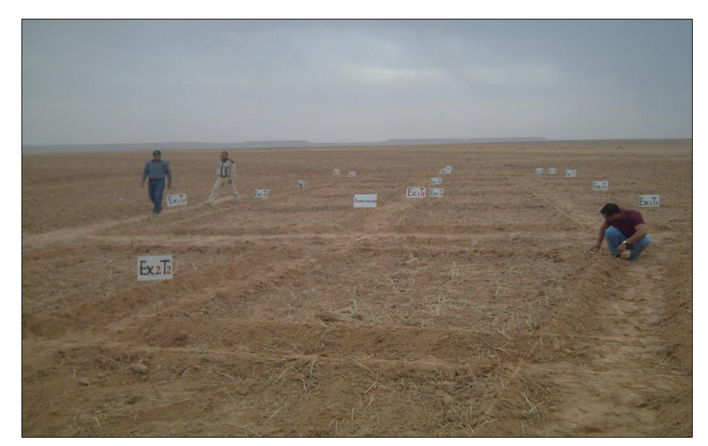
Figure 2: Project team during Field work to prepare for the cultivation of the crop within the sectors of experience

reading was taken from the flag leaf by selecting 10 plants from each replication randomly in a zigzag fashion. Each value was the mean of 3 replications. On 18<sup>th</sup> May 2019, one-meter square area from center of each plot was chosen and harvested by hand individually and separately to measure and calculate the following parameters: number of grains per spike, total weight of 1000 grains, spike length, number of spikes per meter square and total grains yield (t ha<sup>-1</sup>).