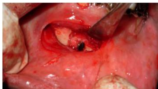
Fig 3. Lag screw fixation