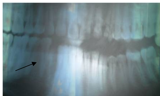
Fig 2. Preoperative OPG