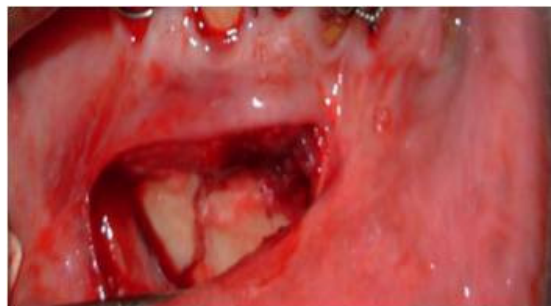
Fig 1. Fracture site

Patients in whom arch bar was put, was removed on the 2 nd postoperative day. Follow up orthopantomogram was taken at 3 months to evaluate healing process radiographically (Fig4).