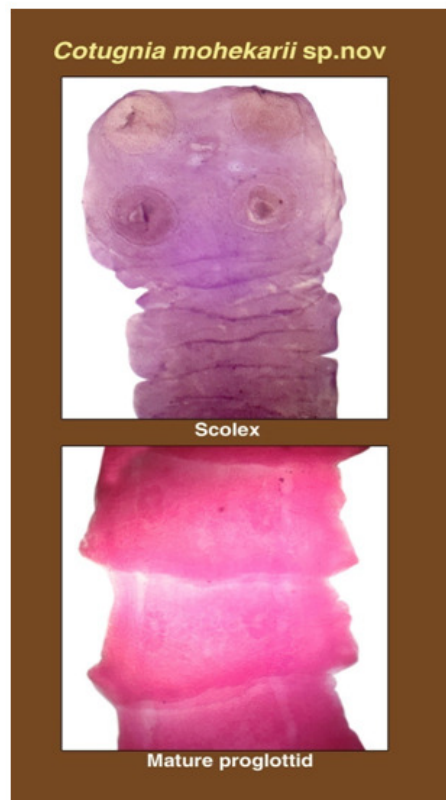
Cotugnia mohekarii sp. nov

posterior to the cirrus pouch, curved, runs horizontally, crosses the excretory canal dorsal to the ovary reaches and opens into the ootype and measures 1.793 (1.794-1.792) in length and 0.038 (0.037-0.039) in breadth. The ootype is small, rounded, postovarian and measures 0.19(0.18-0.20) in diameter. The vitelline gland is medium in size, and measures 0.046 (0.043-0.049) in length and 0.027 (0.024-0.033) in breadth. Gravid proglottids were not available.