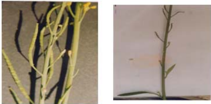
(A) In cms Tounefortii (B) in cms Trachystoma

The Trachystoma male sterile line was late in flowering by 6-7 days while Ogura , Tournefortii and Oxyrrhind were late by 10-12 days. Flowering in Moricandia male sterile system was delayed by 30-35 days, making it difficult to pollinate with its maintainer line. To overcome these difficulty plants of the maintainer lines were pruned before initiation of flowering and thus some flowers on newly emerged branches of maintainer lines were obtained for pollination. In Ogura , Tournefortii and Trachystoma male sterile systems many flower buds on the inflorescence did not open. Most of them did not develop in to fruits and abscised after several days. In Tounefortii and Trachystoma rarely a "cleistogamous bud may develop into a fruit (figs. 2 A & B) On close examination it was found that these buds had protruded stigmatic lobes which might have facilitated cross pollination.