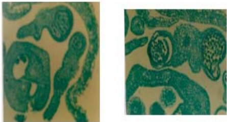
Fig.4 (A-B) Showing reductions in sporangia in the anthers. (A) Tournefortii (B) Trachystoma

The gynoecia along with nectary glands of male sterile lines when compared with their maintainer lines were found smaller (fig 5 A & D). The petaloid stamens are generally found fused with the gynoecium in Tournefortii , the styles in such gynoecia are crooked in Trachystoma . The splitting of stigmatic lobes was also seen along with other abnormalities of stamens.