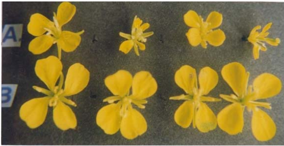
Fig 1. Flowers of male sterile and their maintainer lines showing variation in size (A) male sterile flower (B) flowers of maintainer lines.

The Trachystoma male sterile line was late in flowering by 6-7 days while Ogura , Tournefortii and Oxyrrhind were late by 10-12 days. Flowering in Moricandia male sterile system was delayed by 30-35 days, making it difficult to pollinate with its maintainer line. To overcome these difficulty plants of the maintainer lines were pruned before initiation of flowering and thus some flowers on newly emerged branches of maintainer lines were obtained for pollination. In Ogura , Tournefortii and Trachystoma male sterile systems many flower buds on the inflorescence did not open. Most of them did not develop in to fruits and abscised after several days. In Tounefortii and Trachystoma rarely a "cleistogamous bud may develop into a fruit (figs. 2 A & B) On close examination it was found that these buds had protruded stigmatic lobes which might have facilitated cross pollination.