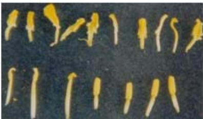
Fig.3 Petaloid stamens (in upper row) in Trachystoma male sterile and normal stamens in its maintainer line.

Petaloid anthers have been recorded in Tournefortii and Trachystoma male sterile lines. The number of petaloid stamens in a flower may vary from one to four. Various stages of petaloidy are observed in these flowers (Fig.3). In the petaloid stamens the number of anther lobes were also reduced (fig. 4 A & B).