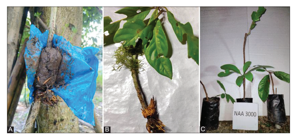
Figure 1: 'A' – Rooted layers of Phoebe cooperiana 60 days after layering; 'B' – Rooted layers of Phoebe cooperiana treated with NAA@ 3000 ppm 60 days after layering; 'C' – Rooted seedling of Phoebe cooperiana treated with NAA@ 3000 ppm two months after transplanting

We observed significant difference (P<0.05) in the response of air layers treated with different auxin concentrations for rooting percentage, mean root number and length of the longest root (Table 1). Between the auxins used, NAA treated layers responded better compared to IBA and the commercial rooting hormone 'Rootex' (Table 1). The rooting percentage was twice higher and the mean number of root almost four times more in NAA treated layers compared to IBA treated ones. The highest rooting percentage was obtained in layers treated with