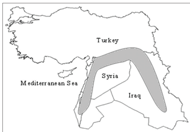
Figure 1: Map origin of the Triticum genus (Map created by M.M. Saleh)