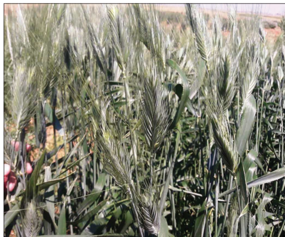
Figure 4: Triticum polonicum L