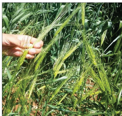
Figure 2: Triticum dicoccum Schuebl

Emmer wheat ( T. turgidum subsp. dicoccum ): Tetraploid wheat, consider as one of the first ancient cultivated cereals. With two types of habit winter and spring, usually have a pubescent leave, very dense and flattened spikes. Spikelet are usually including two flowers and normally are awned. Kernels are red or white stay after threshing together in the glumes. They are small and sharp at both ends (Figure 2). In 1996 Triticum dicoccum occupied