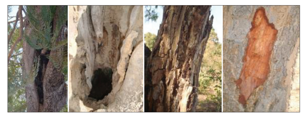
Figure 3: Images of splits, cavities, moulds and peeling on P. biglobosa tree trunks