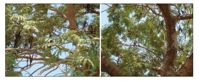
Figure 8: images of damaged fruits hanging on the trees

sanitary constraints. Broadly, the factor site includes many aspects such as climatic aspects like rainfall, temperature, humidity; anthropic aspects like management practices, socio-economic conditions; ecological aspects like soil, relief, toposequence among others. These aspects may cause directly or indirectly sanitary constraints. It was observed that, for the northern site where the climate was dryer and anthropic pressure on poor vegetal resources was high, the prevalence of constraints was also high.