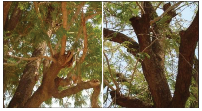
Figure 6: Images of cuts and pruning

with prevalence rates of 87 %, 80 % and 73 % respectively). These categories are the main constraints in all sites. Two categories (1 and 6) had high prevalence at Zanzoni (83 % and 73 % respectively).