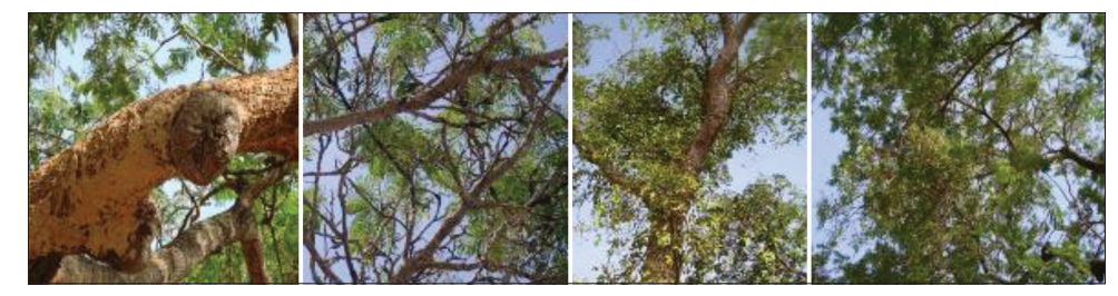
Figure 7: images of attacks by termites, ants and infestation by lianas and Tapinanthus