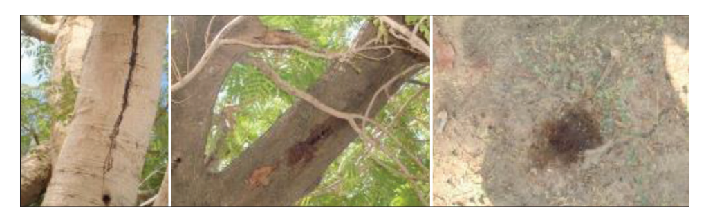
Figure 5: Images of perforation and oozing

Legend: Ci=category i (i=1 to 6), NSZ=north sudanian zone, SSZ=south sudanian zone, NGZ=north guinean zone