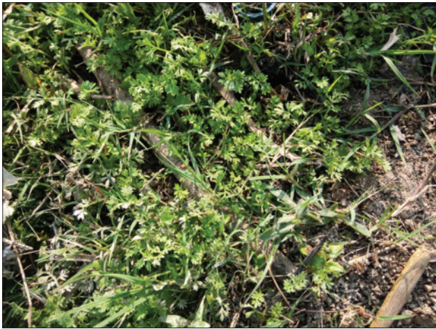
Figure 3: Soliva anthemifolia (Juss.) R.Br. growing on natural habitat