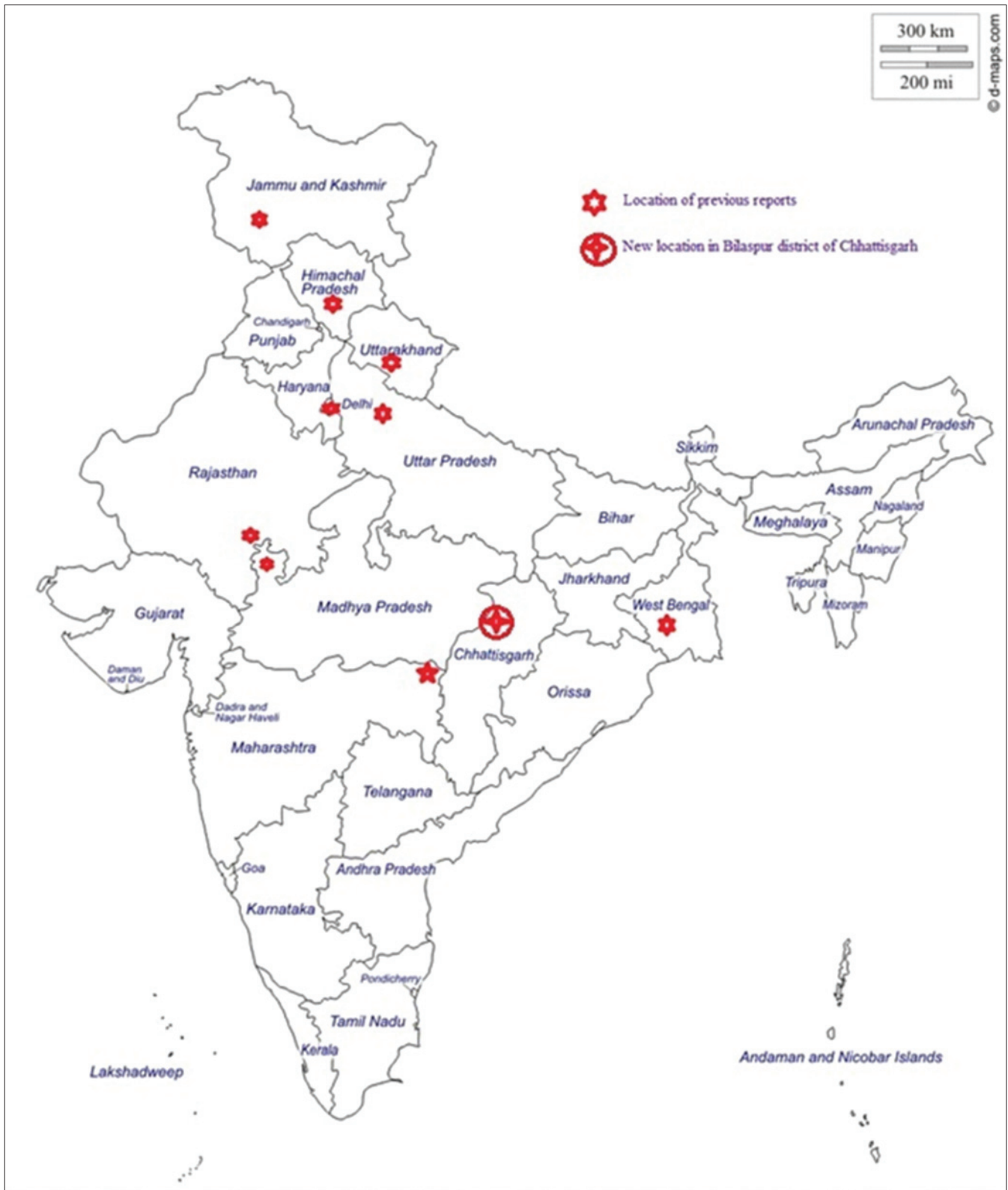
Figure 1: Present records of distribution of Soliva anthemifolia (Juss.) R.Br. in India

corolla long, pale yellow, lobes 3; sterile florets with pistillode admixed with fertile males. Stamens 3; ovary brown, articulated; style curved, 0.1-0.2 cm long. Achene light brown with deep brown center, oblanceolate, ca.