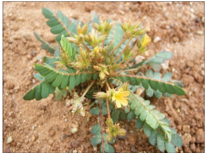
Figure 5: Biophytum sensitivum