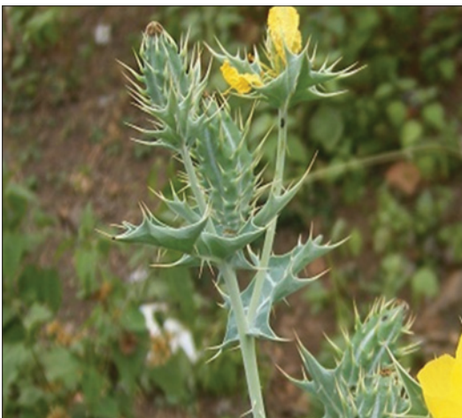
Figure 4: Argemone mexicana