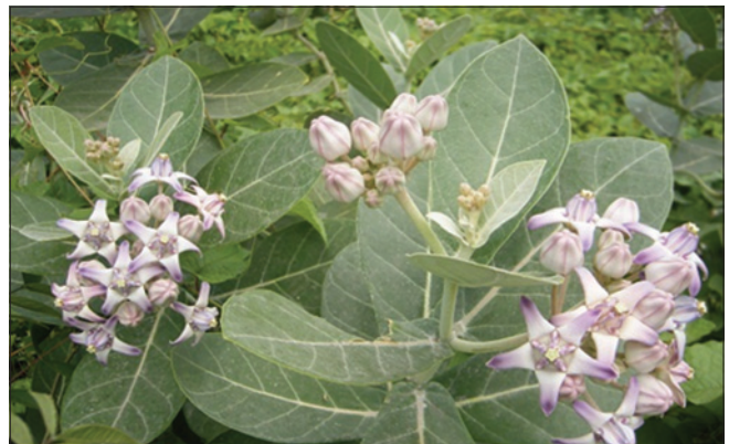
Figure 6: Calotropis gigantea