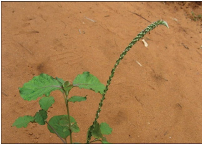
Figure 2: Achyranthes aspera