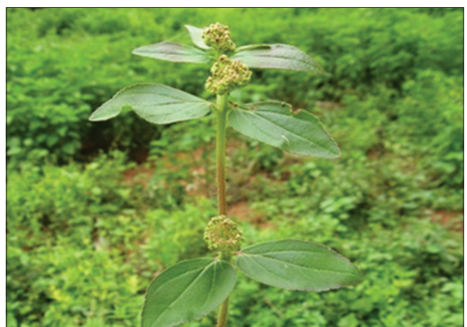
Figure 7: Euphorbia hirta

documented the usage of plant species by various tribal communities in Papikondalu forest, Andhra Pradesh, India, for the treatment of asthma. The knowledge about the ethnomedicinal uses of these plant species and their status of distribution in India would be helpful in exploring these plant resources on a large scale. These traditional plant