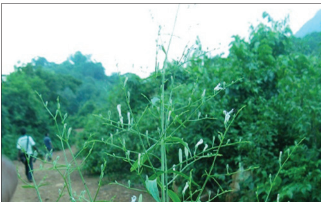
Figure 3: Andrographis paniculata