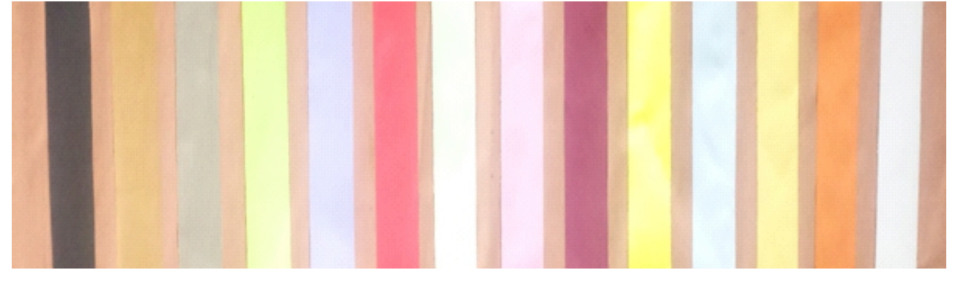
Different colour substrates used for studying the oviposition behaviour