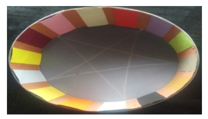
Colour charts wrapped along the galvanised iron trough