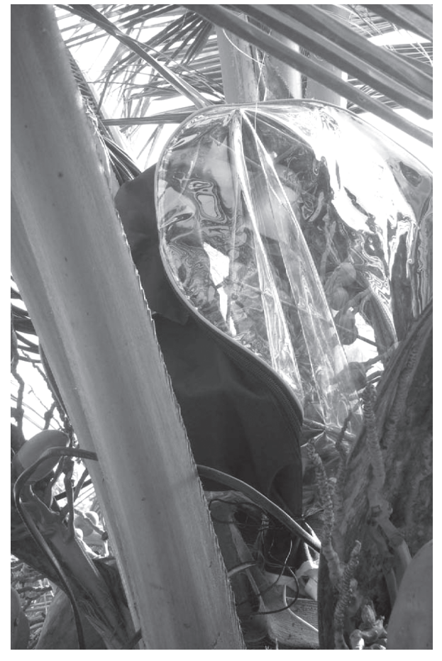
Fig. 3. Image of raincoat fitted coconut tree in the field

Production of hybrid seed nut is beset with seasonal problems like monsoon rain which restricts the hybridisation programmes. Usually, a mother palm on which pollination (hybridization) is carried out for six months yields 36-42 nuts on an average. If the raincoat covered pollination bag technique is adopted, it could result in double the production of hybrid seed nuts (72-84 nuts per year). If 100 mother palms are available for hybridization, the recovery of hybrids seedlings is usually 1500-1600. By adopting the raincoat attached pollination bags, the recovery of hybrid seedlings from 100 mother palms can also be doubled to 3000-3200. This simple technique can ensure enhancement in coconut hybrid nuts production throughout the year in areas with heavy rains, and it could also save labour and ensures safety.