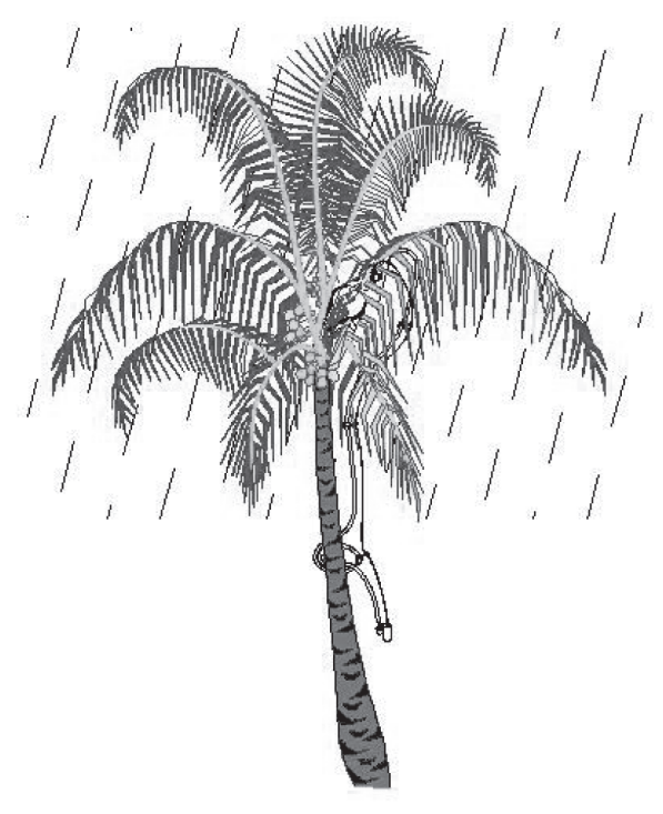
Monsoon Pollination system

Pollination raincoat for hybridization in coconut