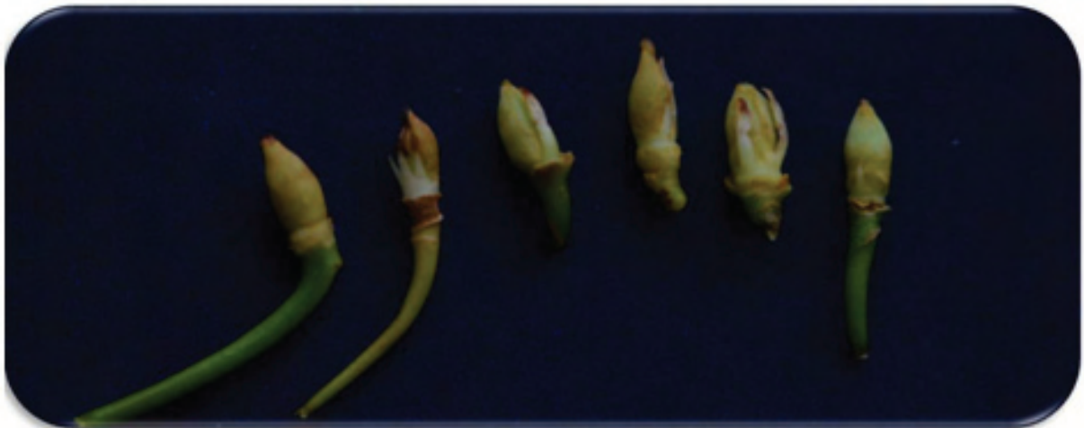
Fig. 2. Intra flower variability in number and length of anthers of hermaphrodite flowers