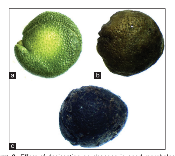
Figure 3: Effect of desiccation on changes in seed morphological traits in curry leaf. a. Fresh seed (viable); b. 15 days after desiccation (non-viable); c. 30 days after desiccation (non-viable)

desiccation (Table 2). Therefore, the seed colour becomes brown or black at 30th day of desiccation (Figure 3) and indicates the death of the seed. In addition, the \alpha -amylase enzyme activity was also reduced in desiccating seed in which it was higher in fresh seed (10.75 mg g-1 of seed) and tends to decrease rapidly (6.24 mg g<sup>-1</sup> of seed) during desiccation storage (Table 2). The total phenol content was also showed decreasing trend in curry leaf seed during desiccation in which, it declined from 8.96 to 6.28 µg g<sup>-1</sup> of seed (Table 2). Similar to curry leaf, increased seed leachate contents due to desiccation were reported earlier in arecanut [18]. Cell membrane instability leads the electrolyte leakage [30, 31]. During desiccation, reduction in phenol content was noticed in arecanut seeds also [18]. Similar reports on loss of membrane integrity leads to efflux of cellular constituents like sugar, amino acid, phenol and phosphates were reported earlier [32]. Also, reduction in amylolytic enzyme activity during desiccation seeds was reported earlier [33-35].