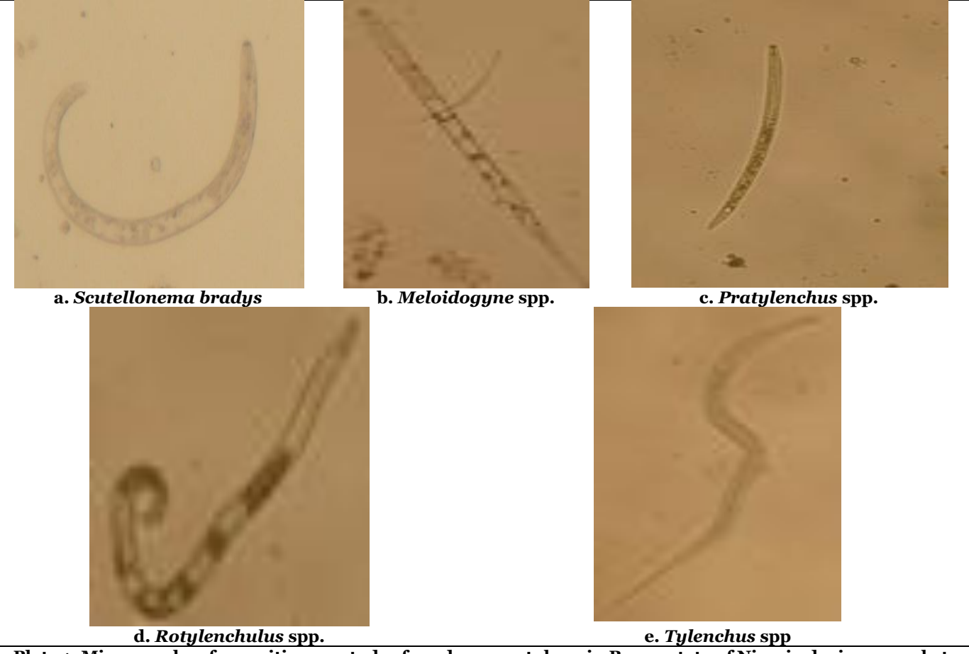
d. Rotylenchulus spp. Plate 1: Micrographs of parasitic nematodes found on yam tubers in Benue state of Nigeria during a market survey in 2017 (X60)