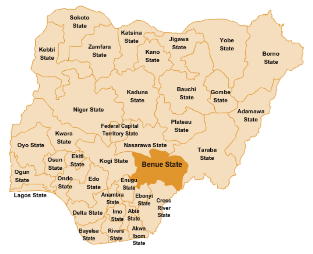
Fig. 1: Map of Nigeria showing the surveyed state for yam nematodes

Nematodes like Scutellonema bradys, Meloidogyne spp and Pratylenchus spp attack yam in many countries [24]. Estimates of the damaging potentials for Pratylenchus coffeae indicate that where the number of individuals in soil exceeds 600 per plant of Dioscorea rotundata [13]. Yields of yams severely infested with M. arenaria can be reduced by 24-80 % in Chlna [20] while population of M. incognita as low as 100 juveniles per plant are said to reduce tuber yields of D. rotundata in India [25].