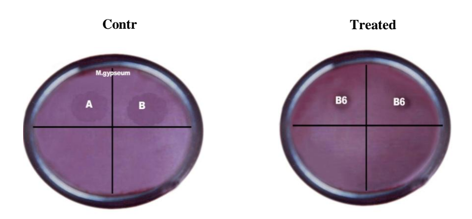
Fig. 4. The zone of inhibition of Microsporum gypseum treated with band 6 of Tecoma stans in MIC method.