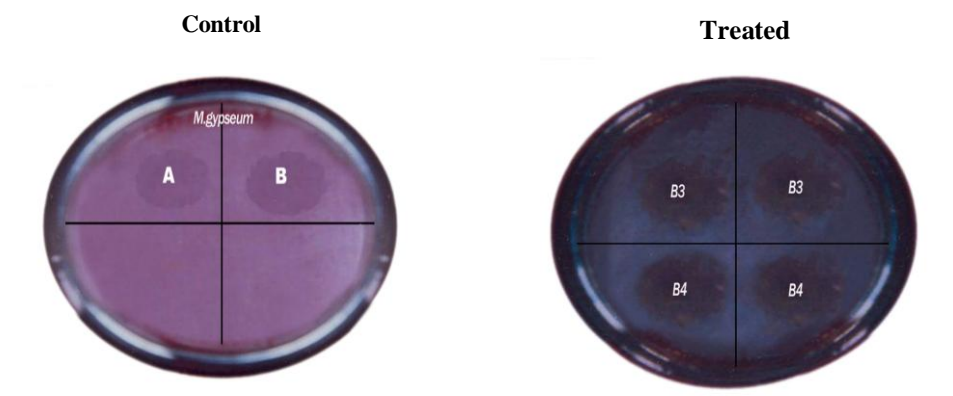
Fig. 2. The zone of inhibition of Microsporum gypseum treated with and 3&4 of Tecoma stans in drop diffusion method