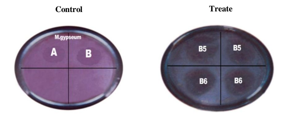
Fig. 3. The zone of inhibition of Microsporum gypseum treated with band 5&6 of Tecoma stans in drop diffusion method