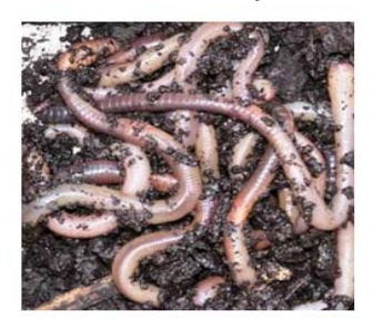
Plate: 1. Eisenia fetida