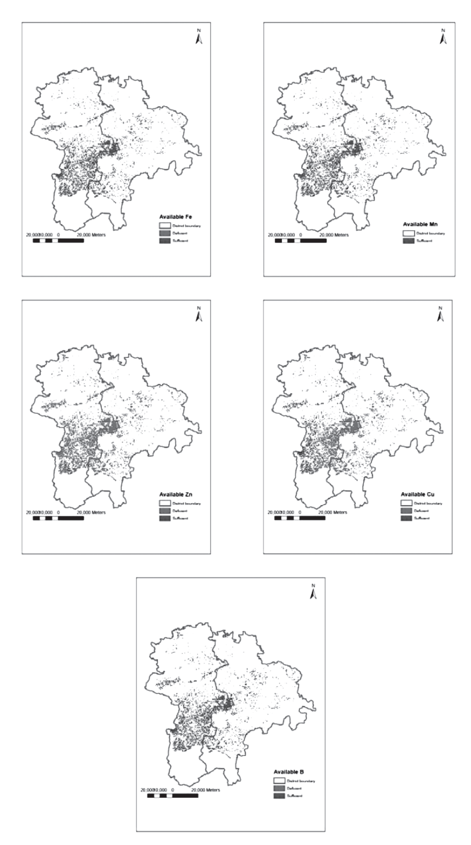
Fig. 2. Spatial distribution of soil micro-nutrient status in the coconut land cover of Coimbatore and Tiruppur districts of Tamil Nadu state