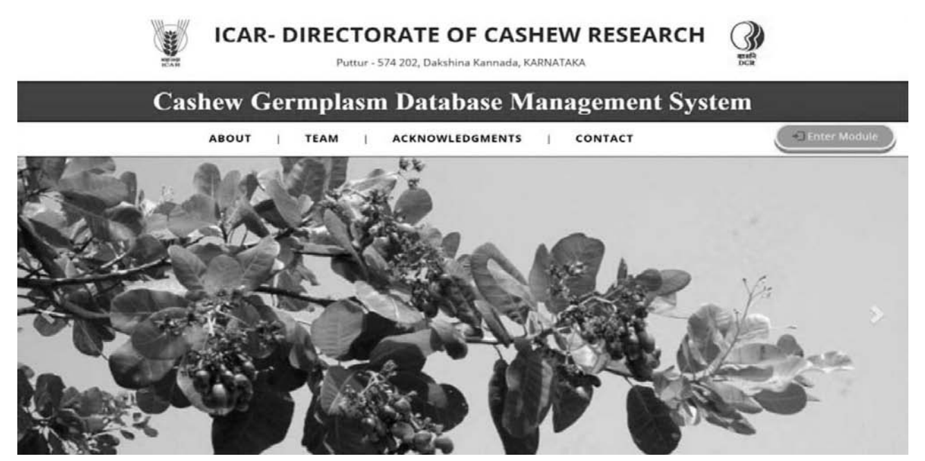
Fig. 1. Landing page of decision support system on cashew

The DSS for cashew germplasm management has been developed using (https://cashew.icar.gov. in/dcr/) the following technology stack. The database on 478 accessions with 68 characters was developed using MySQL. For front end (user interface), HTML5, CSS3, Twitter Bootstrap, jQuery, MasonryjQuery, Select2-jQuery, amCharts, FlexSliderjQuery have been deployed. A PHP5 framework-Laravel was used for backend (server side).